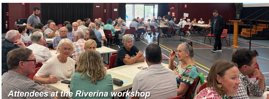
Attendees at the Riverina workshop